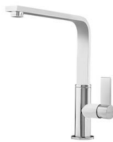
Mixer Tap NYC 8486 000