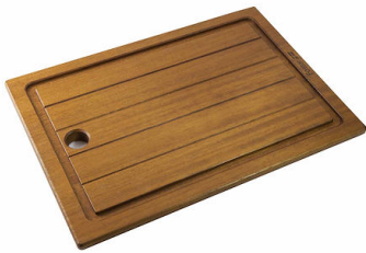
Iroko-wood chopping board 8643 117